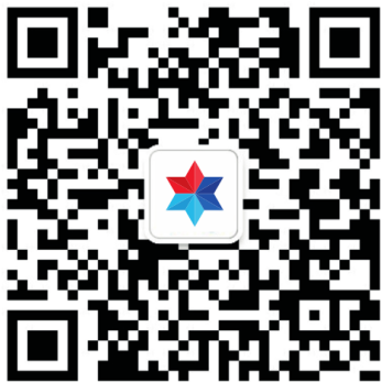
BritCham Shanghai Official WeChat Account