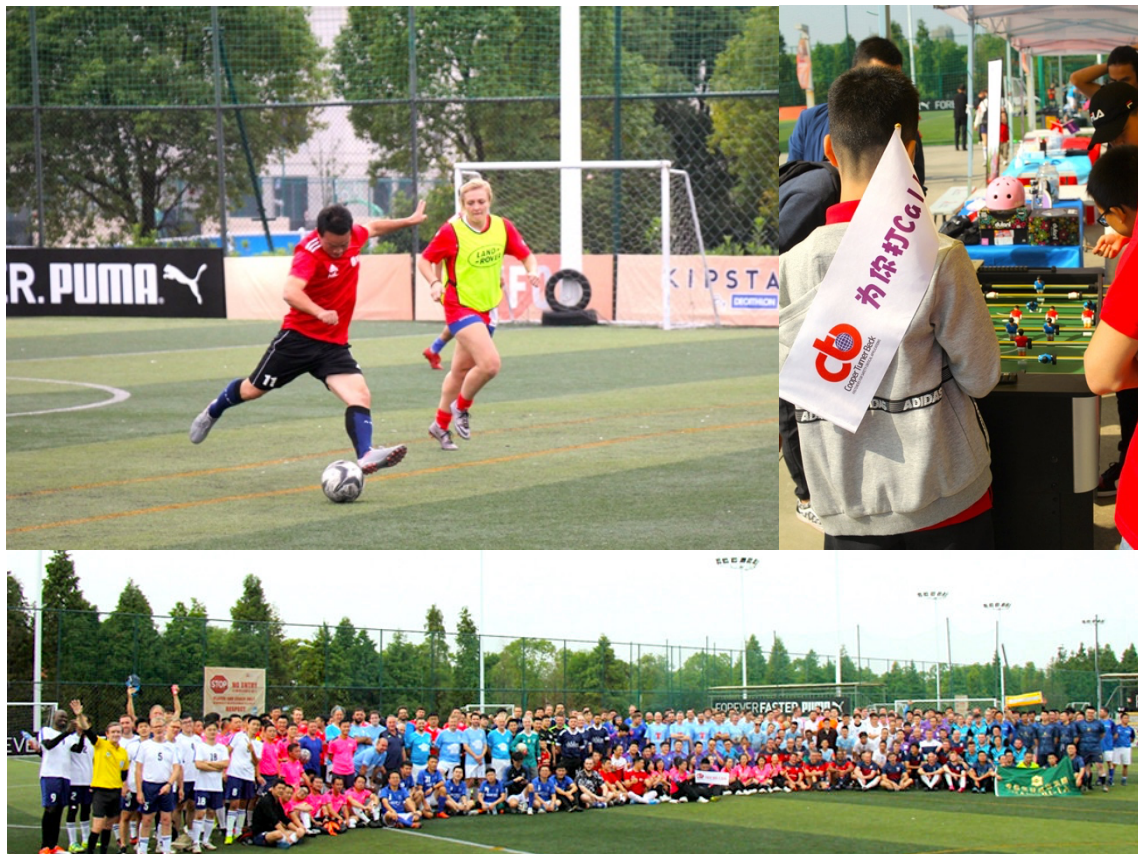
Previous Football Tournament