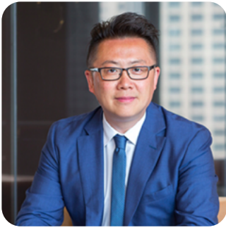
Moderator 14:55 - 15:35