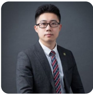
Moderator 14:00 - 14:45