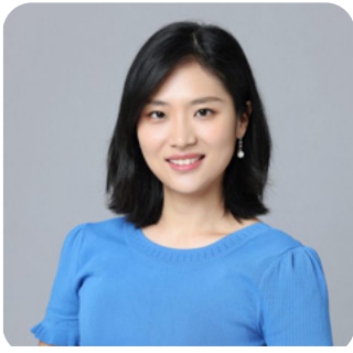
Moderator 14:00 - 14:45