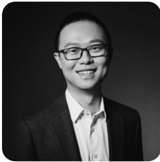
Speaker 14:50 - 15:05

BRE is a world leading building science research institute, dedicating to improving built environment sustainability, quality construction and productivity.