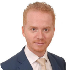
Speaker 11:20 - 11:35

She is a regular speaker on green impactful innovation, low carbon architecture, water and sanitation issues as well as women's leadership.