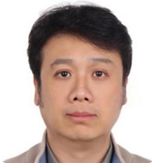
Speaker 15:35 - 15:50

Responsible for Sedex's brand and project operations in China and Southeast Asia, and has been involved in many responsible business projects (e.g. RSCA, etc.) with relevant UN organizations. Sustainable and responsible supply chain expert, focusing on corporate sustainability, especially its performance in the supply chain, and actively promoting corporate supply chain responsible management. Focus on sustainability influence communication and stakeholder communication. Master of Communication. Initiator of Sedex Supply Chain Awards (Greater China).