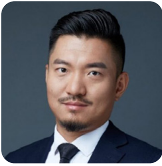
Moderator 10:15 - 11:15