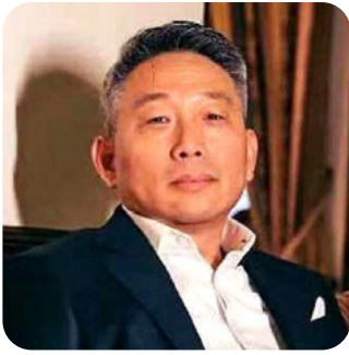
Moderator 11:35 - 12:20