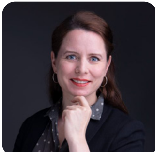
Panelist 14:00 - 14:45

She holds a Bachelor degree in English Literature from Beijing Language and Culture University and Master degree in Development Planning and Administration from University College London.