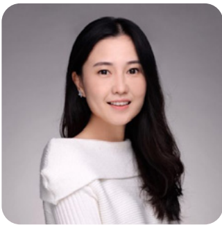
Panelist 10:15 - 11:15